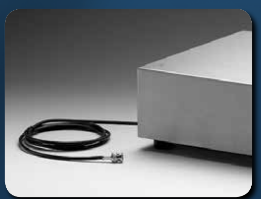
Customized stainless steel scales