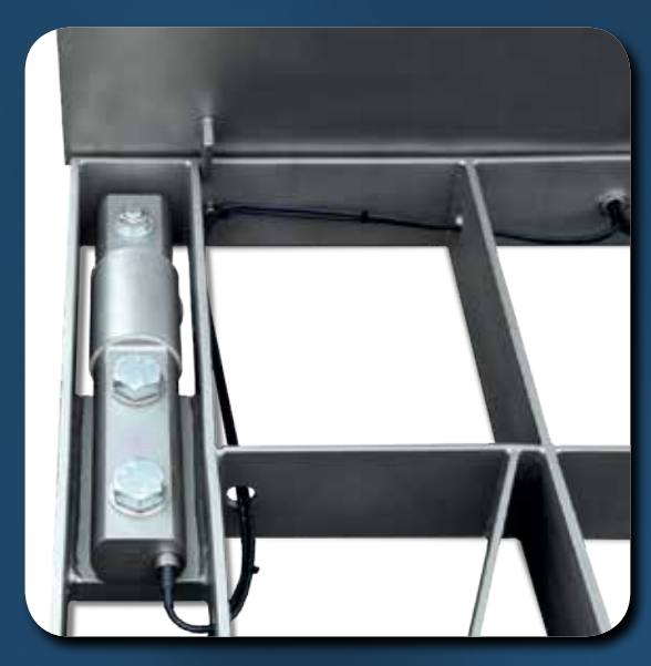
Very safe to handle